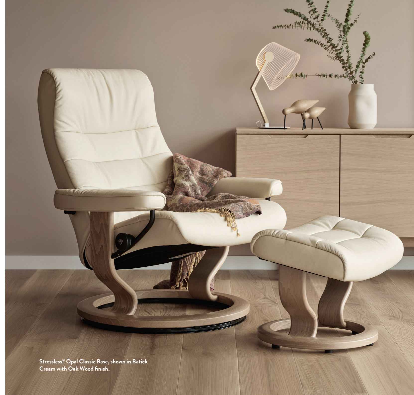
Stressless ® Opal Classic Base, shown in Batick Cream with Oak Wood finish.

Only available in Batick Cream with Oak finish, Batick Mole with Walnut finish, Batick Dove with Oak finish or Batick Brown with Brown finish. *Whilst stocks last.